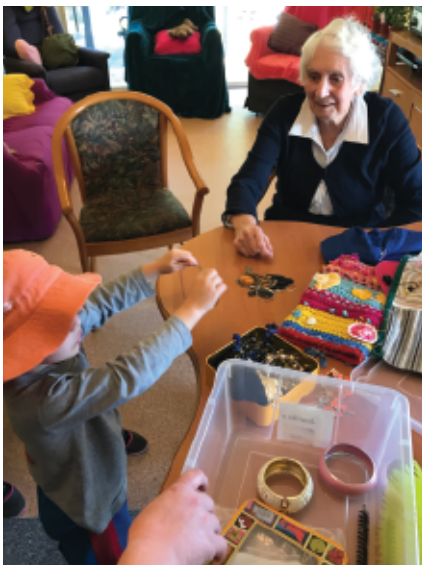
Port Broughton Kindergarten children visit the homes regularly and join in with meaningful engagement with lots of laughs and smiles.

“The laughs are endless and I can’t wait to create more memories and special moments.”