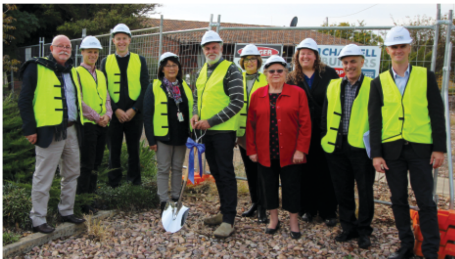
The Barunga Village Building Committee turning the soil for the new development.

WORKS ARE EXPECTED TO BE COMPLETED BY MAY 2018