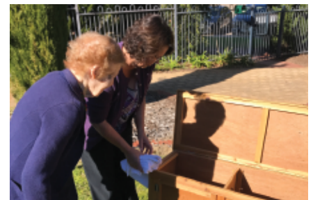
People living in the Butterfly Homes have welcomed new additions to their family, with two guinea pigs and four chickens. Everyone takes part in feeding and looking after these pets.

Kindergarten children and school students have recently become more involved with the people living here by visiting and creating great moments of interaction and happiness. The RSL also kindly donated $1000 to purchase four raised garden beds, which have made the outside area much more engaging. We were able to plant sensory type herbs and flowers to create special aromas and colours in the garden. Thanks to the RSL for such a generous donation. You can read more about this donation on page 15.