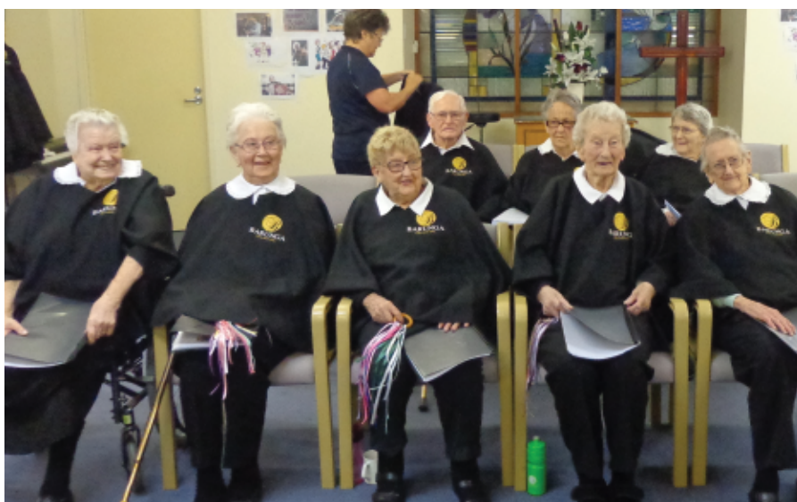
Members of the Barunga Village Choir ready to take part in the Skype concert.

A wonderful time was had, with lots of cheering (and jeering) but it was all good-natured. The teams will go head-to-head in another match later in the year. This was the third competition they've had with the Day-Care Movers and Groovers winning the first two matches.